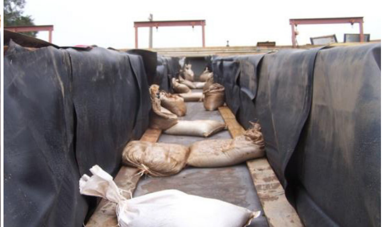
Weighting edges during initial 24-hour cure