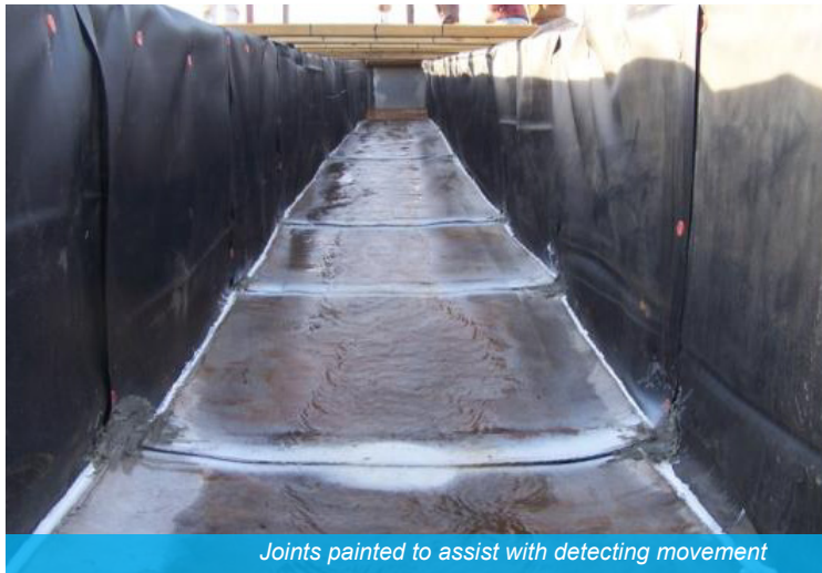
Joints painted to assist with detecting movement