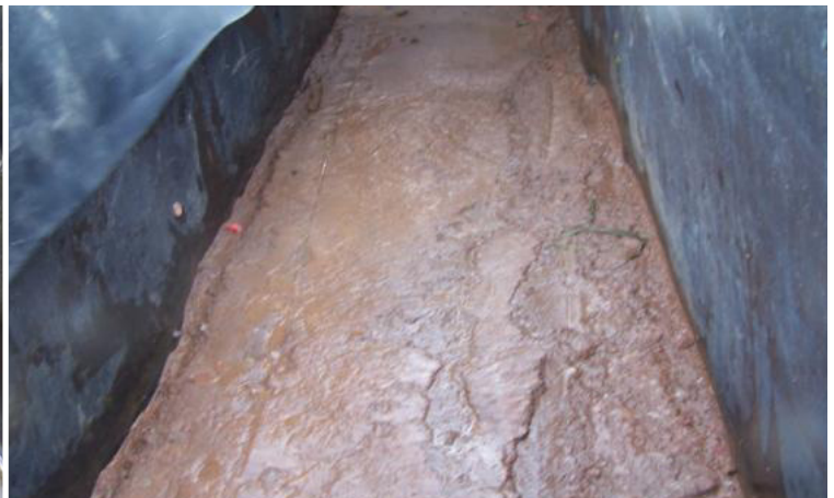
Only subgrade changes seemed related to wall seepage