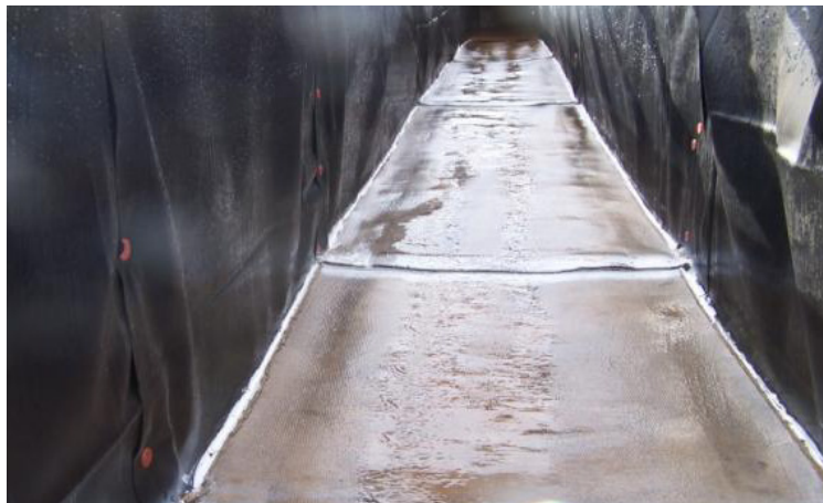
No separation at joints detected