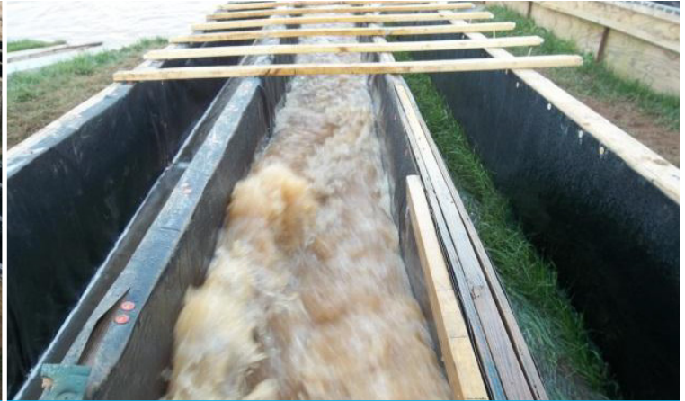
Maximum water flow over Channel 2