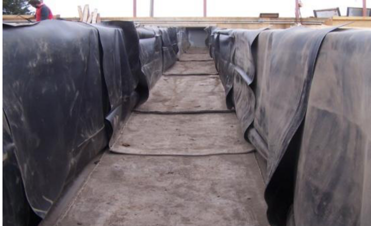
CC during installation

The product was hydrated according to recommended procedures, and sandbags were placed on top of the joint overlaps to hold the CC layers together during setting. The sandbags were removed once the product was set and before testing commenced. The CC was allowed to cure to full strength (~10 days) prior to performing the flow test.