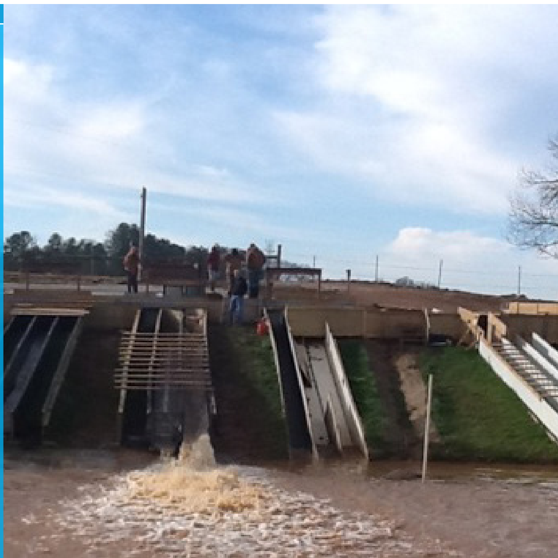
Flume test in progress

TRI Environmental, Inc. ran hydraulic testing for Milliken & Company to quantify the hydraulic flow capacity of the Concrete Canvas® GCCM, and answer the question “How much water can flow over CC8™ before it is dislodged, lifted up and/ or washed away?”