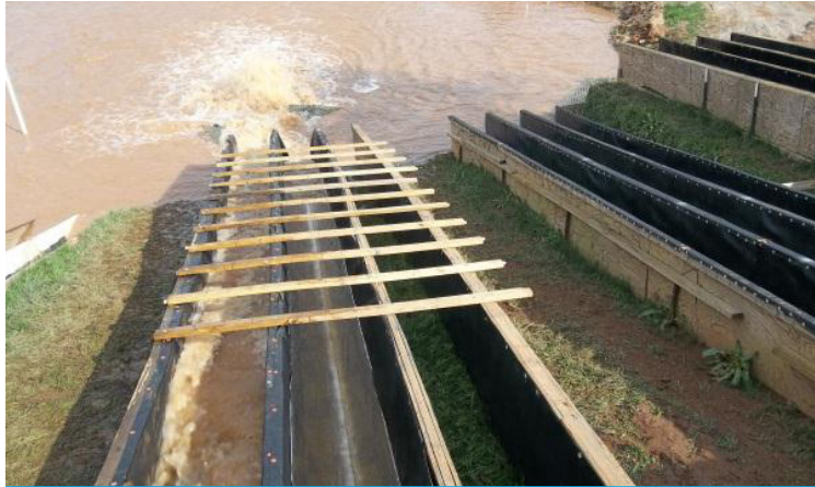
Maximum water flow over Channel 1